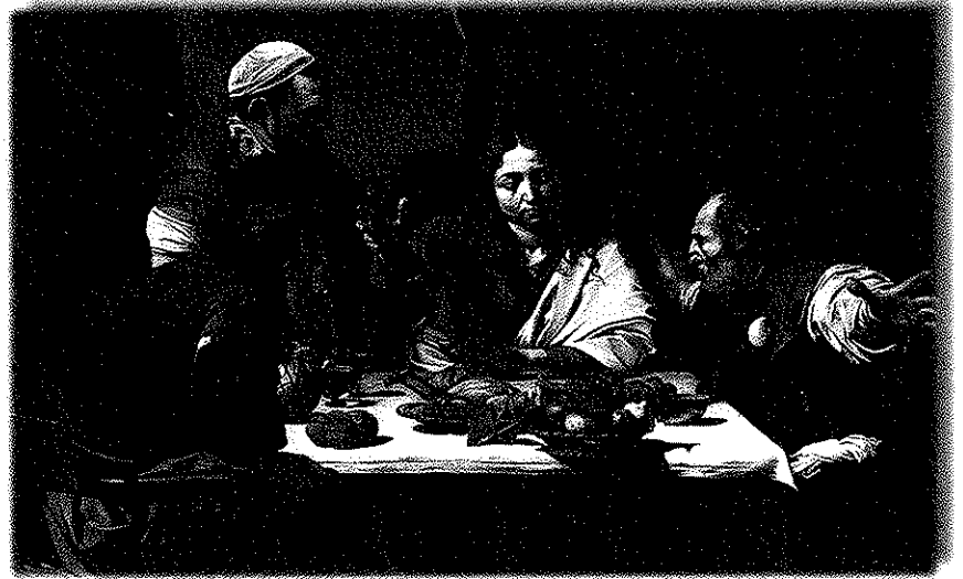
Supper at Emmaus (Caravaggio 1601)

In Luke's gospel he tells the story of a "Supper at Emmaus" where followers of Jesus encountered a "stranger" on the road following the crucifixion. Upon hearing the story of God's salvation, told to them by this stranger their hearts burned. While breaking bread with this man they recognized that it was Jesus himself and that they had witnessed the resurrected Christ.